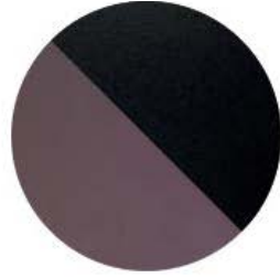
Burgundy with Raven