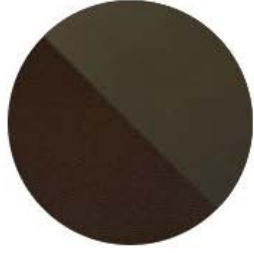
Umbria with Graftone