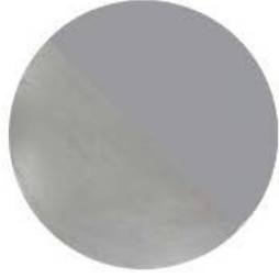
Galvanate with Nimbus