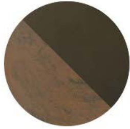
Cor11 with Graftone