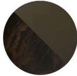
Aged Bronze with Graftone

303.589.4524 hello@parasoleil.com parasoleil.com