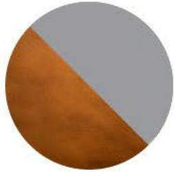
Moneypenny with Nimbus