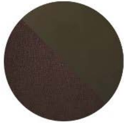
Copper Foil with Graftone