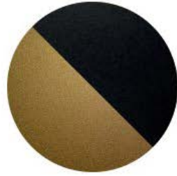
Antique Gold with Raven