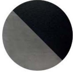
Industry with Raven