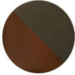
Deep Bronze with Graftone