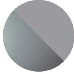
Buffalo Dime with Nimbus