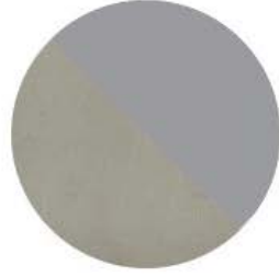
Buff Stone with Nimbus