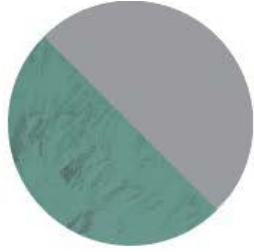
Liberty Verdigris with Nimbus