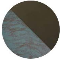
Native Turquoise with Graftone